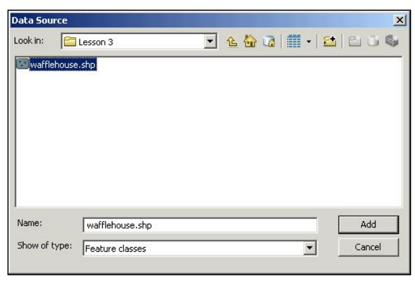
Figure 2 – Data Source window.

Save the map document as H:\ CitrixTraining\exercises\lesson3.mxd and exit the ArcMap.