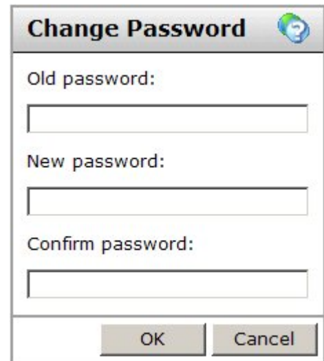
Figure 2 - Citrix Change Password

Important: Changing your Citrix password does not change your SDE Oracle password.