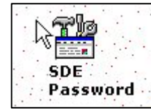
Figure 3 - SDE Password icon.

Click on the SDE Password icon (Figure 3) in the Applications window.