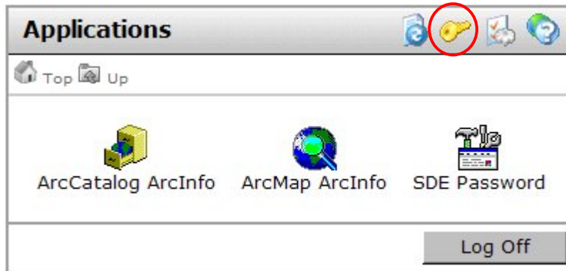
Figure 1 - Citrix Application window with Change Password icon circled in red.

After successful connection to the LOJIC Citrix server, you will see a window containing icons of available applications. Click on the Change Password (key) icon. (Figure 1)