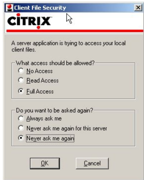
Figure 3 - ICA Client File Security window.

Set allowable access to Full Access (this setting is required) and the auto reminder to Never ask me again , or to whatever level with which you are comfortable.