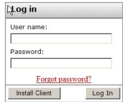
Figure 1 - Citrix Login

If you are accessing the LOJIC Intranet outside of the MSD, PVA or Metro Government networks, log into the application by opening Internet Explorer and go to http://remote.lojic.org . Your LOJIC intranet username and password will be provided to you by the LOJIC System Administrator.